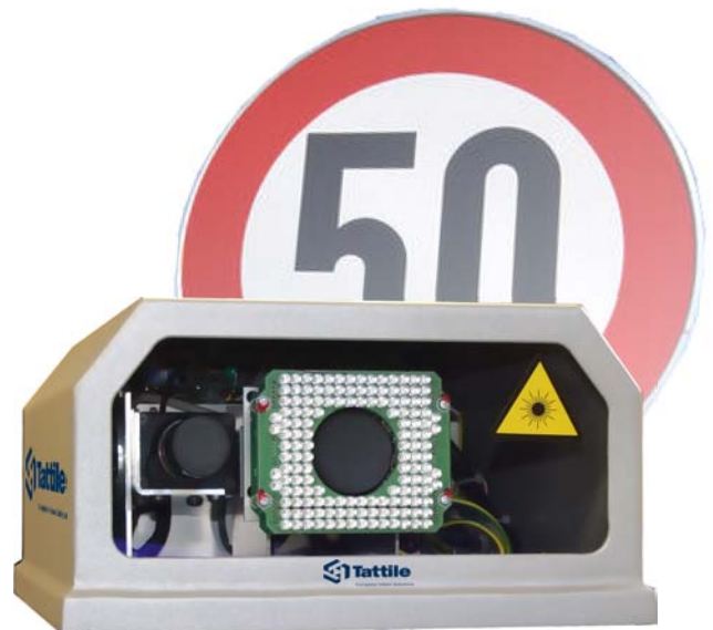
Red & Speed Front View