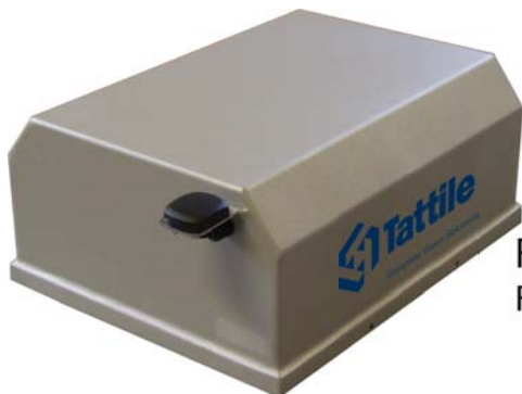
Red & Speed Rear View